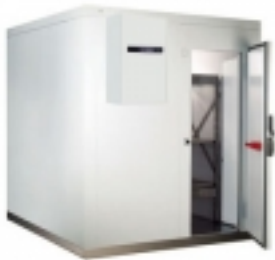
Cold / Freezer Rooms Junior Professional 1460mm depth

Excel Catering, Refrigeration and Air Conditioning