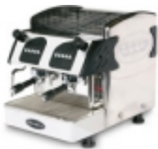
Stafo Markus Compact Coffee Machine

High capacity combination temperature units, ideal for busy supermarkets. [Product Details...]