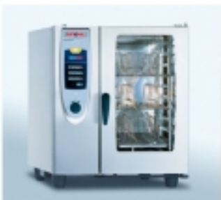
Rational: 10 Grid Self Cooking Centre

The Markus Compact is only 460mm wide, giving enormous savings yet still being able to produce the same amount of drinks as any other two group machine. Equally at home using ground coffee from a dispenser or pods; as well as with a traditional portion [Product Details...]